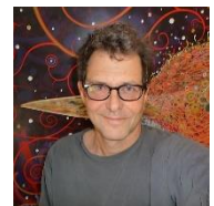
FRED TOMASELLI (1956-)

Fred Tomaselli is an American artist. Pattern features prominently in much of his artwork, as well as nature, beauty and space. He is best known for his highly detailed paintings on wood panels, combining different collage materials (including text from newspapers) in a thick layer of clear, epoxy resin.