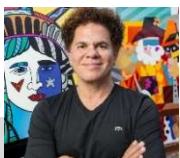
ROMERO BRITTO (1963-)