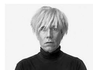
ANDY WARHOL (1928-1987)

Simple, bold, bright images of everyday items and people.