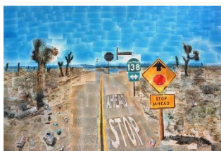
Pearlossom Highway (1966)

David Hockney created Pearlossom Highway over several days while in California. He took many photographs of a view on route. The resulting artwork is a picture of the American landscape from both a driver's perspective and the passenger's perspective.