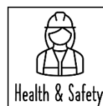
Health & Safety