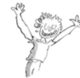
VIOLET BEAUREGARDE A girl who chews gum all day long