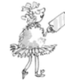
VERUCA SALT A girl who is spoiled by her parents